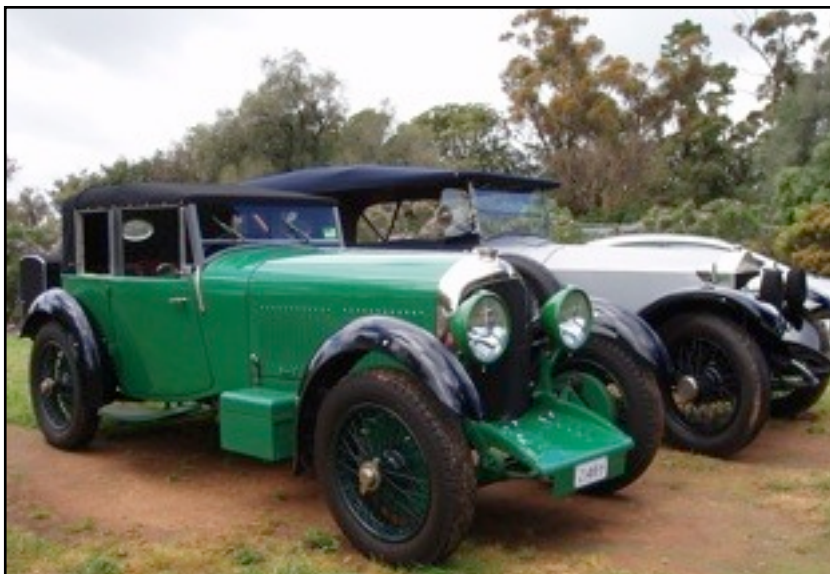
Above: Bentley 4.5L & 1921 Rolls-Royce.