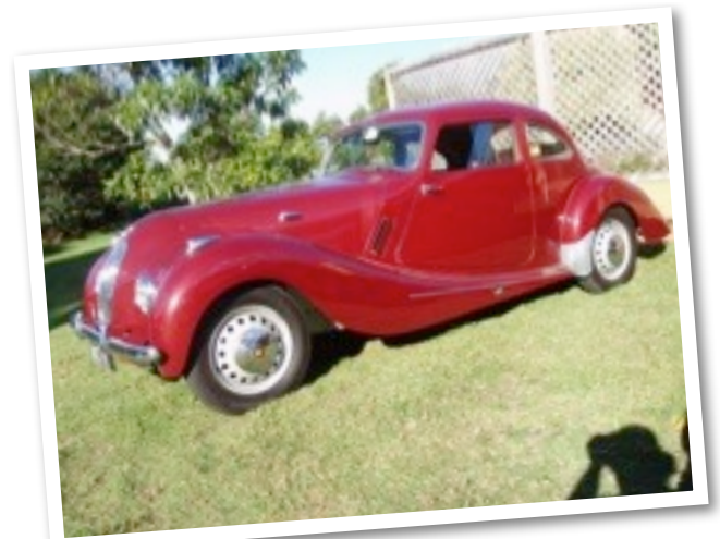
Above: Bristol 400