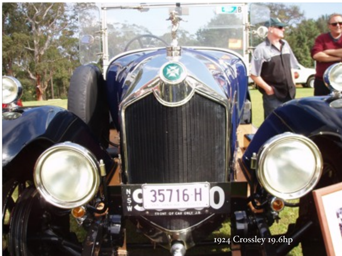
1924 Crossley 19.6hp